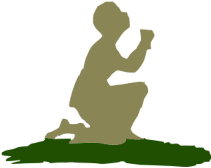
Forgive my sins