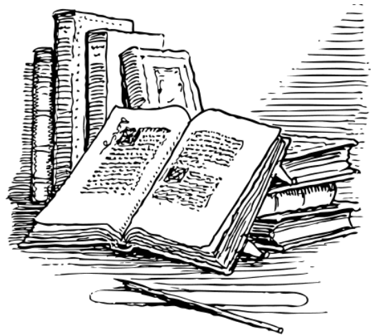
Preserve the records