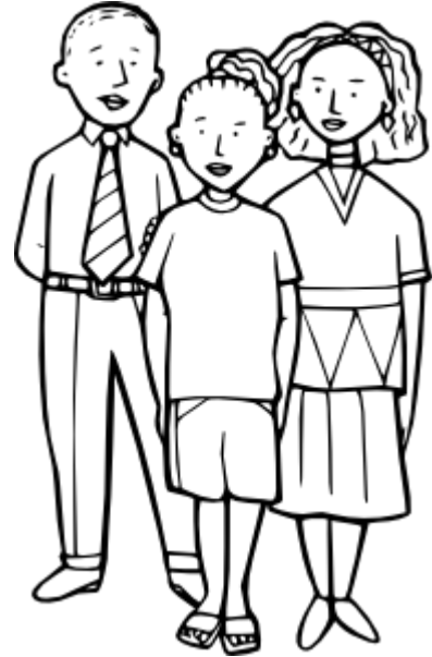
Bless my family